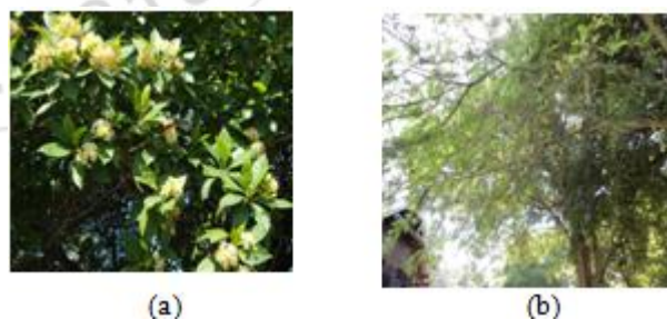
Figure 4: Plants dewadaru (a) flowering and fragrant smell in SMP Negeri 1 Karimunjawa and Kalimasada (b) as local wisdom

In this research, exploration and discovery of the kinds of plants Local wisdom in Karimunjawa. The results of research in the various islands of Karimunjawa found indigenous plants contained in maritime Publications, for example Dewadaru plants and Kalimasada as shown in Figure 4.