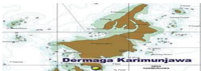
Figure 1: Map of Karimunjawa islands

The location of this research is Karimunjawa, as shown in the following map.