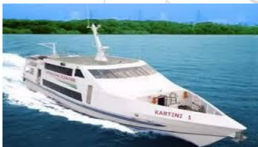
Figure 2: Ship Kartini to transport Semarang to Karimunjawa

In the study, the research team towards the island of Karimunjawa using ship transport ship Kartini of Semarang toward karimunjawa or otherwise with a long trip around 5 hours or may use air travel from Semarang to Karimunjawa and takes about 40 minutes